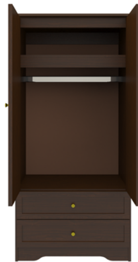
Model: MIWR22 34.5W 23.75D 71H

Time-honored crafting and practical concerns blend to produce refined, functional furniture. OG edging and gently radiused corners add understated touches of distinction to these water- and scuff-resistant, fire-retardant products. Choose from dozens of hardware styles, including ADA-compliant. The product is required to be wall mounted for safety. Using the kit provided, please follow provided instructions exactly.